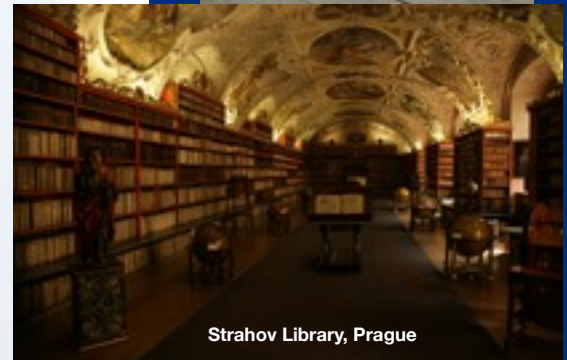
Strahov Library, Prague